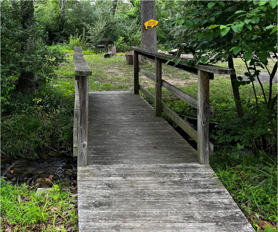
(View across one of two bridges to The Island)

The majority of our weekend events will center around The Island. This is the piece of land surrounded by the creek that is in between our creek-side camping and the cabins. Most ceremonies and meetings will take place here. Please note, meet here for the long pull Saturday Morning. The High Tea and wedding will take place at campsite #29, right next to The Island, around the big tree.